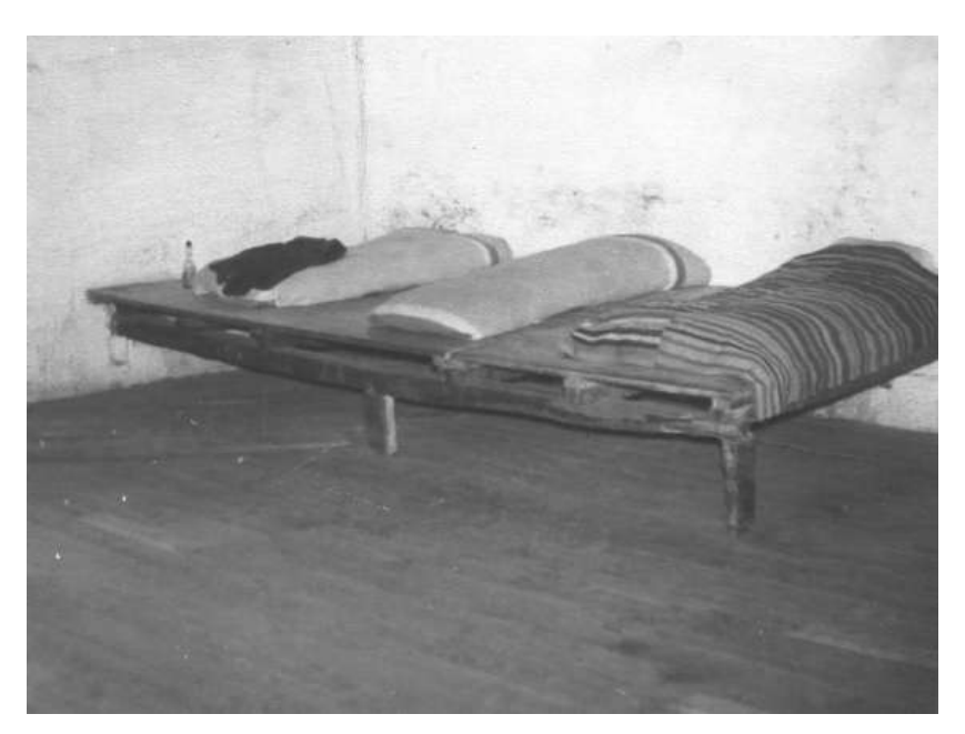
Image 9. "Man's cell chamber", 1959

The role of jails in the twentieth century was very different from today. While in the first half of the twentieth century the jail served mainly to 'keep' those who committed crimes and those who were insane/alienated from society, prisoners are now expected to rehabilitate, so as to reintegrate them into society. "The disciplines mark the moment when the reversal of the political axis of individualization - as one might call it - takes place. In certain societies, of which the feudal regime is only one example, it may be said that individualization is greatest where sovereignty is exercised and in the higher echelons of power" (Foucault, 1988, p. 192). Whereas in the last century any space that allowed several people to be packed and held captive until a trial served as a prison zone. Vigilance is now imperative in prisons, and thus buildings are designed to keep criminals away, are "guarded" under a greater supervision, depriving them of their freedom, but keeping their individuality confined to the cell. "It would not be true to say that the prison was born with the new codes. (...) procedures were being elaborated for distributing individuals, fixing them in space, classifying them, extracting from them the maximum in time and forces, training their bodies,