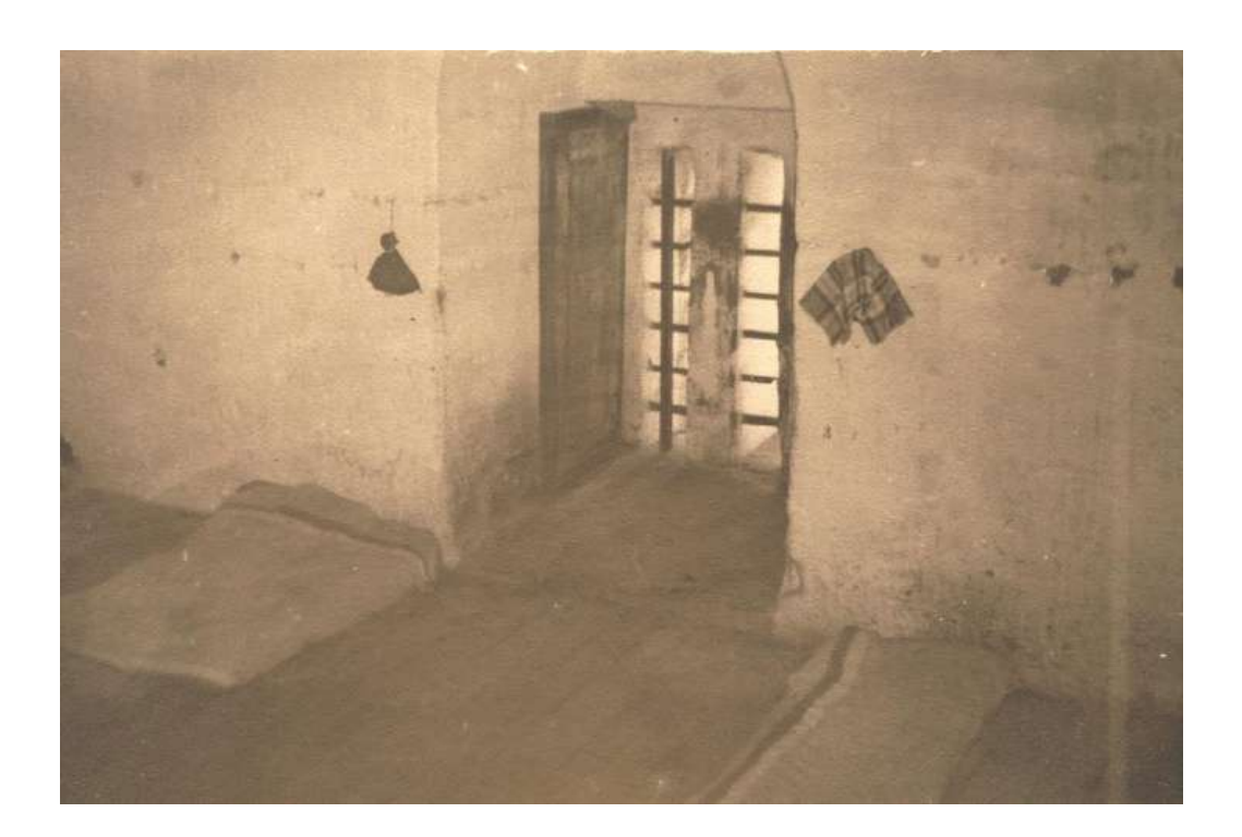
Image 3. "Partial view of men's cell - the darkest", 1959

After formulating the request with the knowledge of the General Director of the DGRSP, we learn that there was a file with inspection reports and photographs of a visit amde by DGRSP. In order to have access to these data, a formal request was made to visit the premises where these documents and images were located – the prison area of Santa Cruz do Bispo. After obtaining the endorsement of the General Director of DGRSP, we visited Santa Cruz do Bispo facility were held in December 2014 and resulted in the aggregation of the main inspection reports and photographs of the interior of the jail. The photographs and reports collected were never published and had never been shown in public, so it emphasized the value of discovery of this investigation.