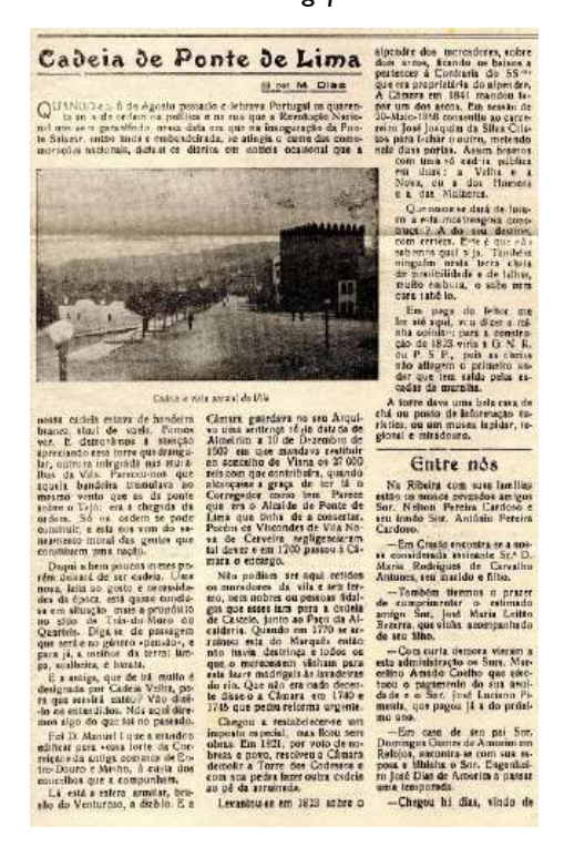
Image 2. Clipping of page 3 of Cardeal Saraiva Newspaper, September 16, 1966

In a first phase the main newspapers and radio stations of Ponte de Lima were contacted in order to propose news articles informing that an investigation was being carried out on the last years of operation of the jail and that it would be necessary to the contribution of Ponte de Lima's population through testimonies, photographic and videographic records relevant to make the study feasible. From this request resulted two positive answers: in the first one, which was materialized in an interview in the 'Manhãs de Sábado' program of Ondas do Lima radio, the research project was explained, what we wanted to know and what information was needed. An application was also made to the Ponte de Lima's community, in the event they have knowledge of stories, photographs or videos that involve the jail, to submit this data through the online platform cadeiavelha.blogspot.com.