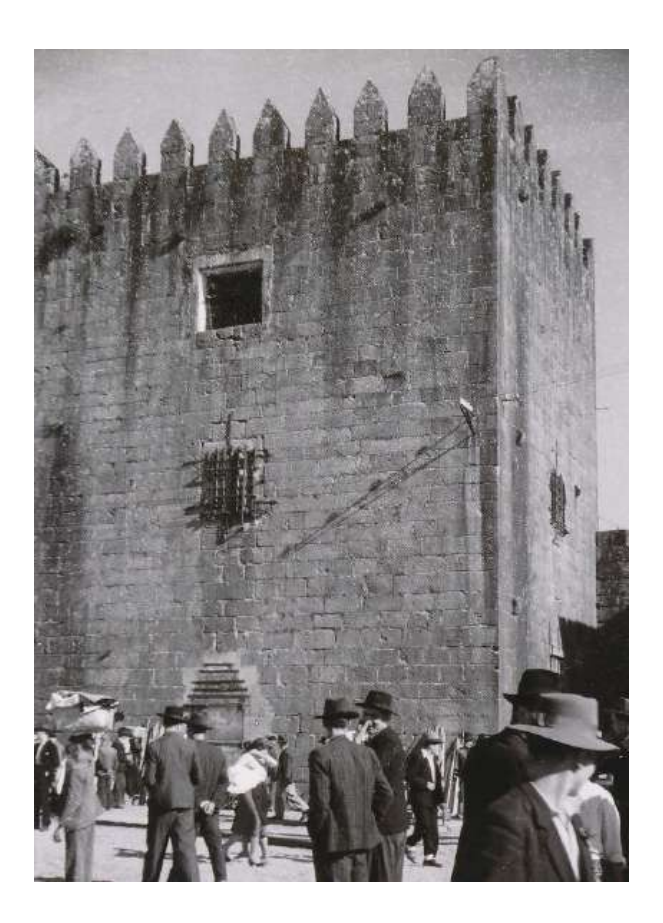
Image I. "A Lata e o Cordel", Conde d'Aurora, 1950s

society that informs and is informed by sets of different disciplinary agendas and theoretical principles. Rather than being a method fot the collection of 'data', ethnography is a process of creating and representing knowledge (about society, culture and individuals) that is based on ethnographers own experiences' (Pink, 2001, p. 18).